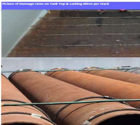
Annexure - I

Note : Port tariff is subject to Annual revision basis prevailing market conditions and Port management discretion.